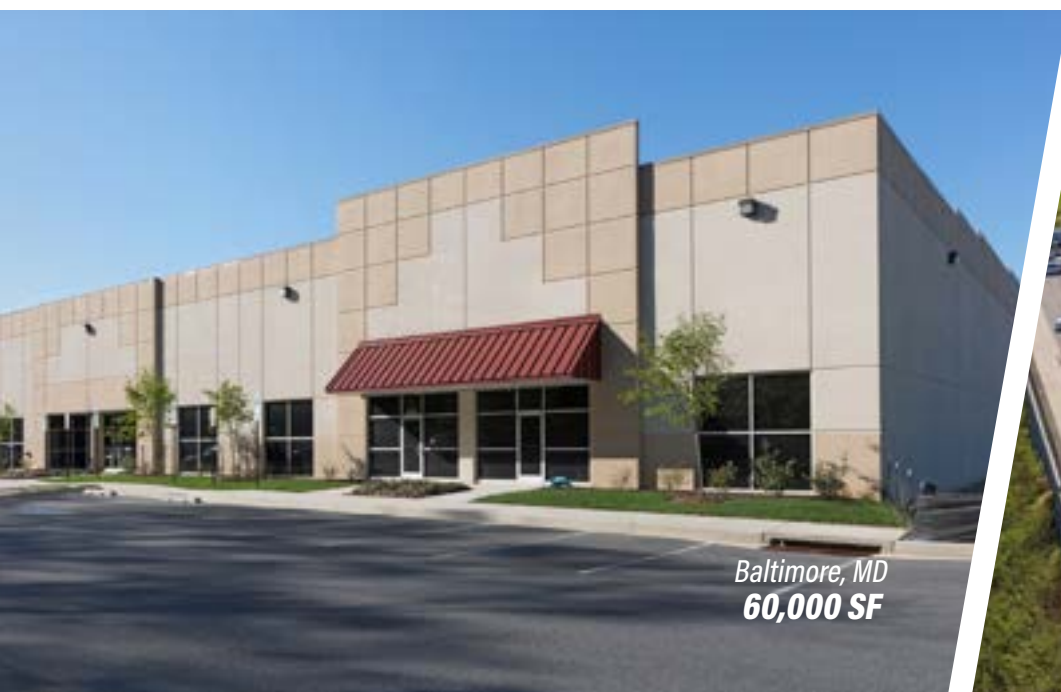
Baltimore, MD 60,000 SF