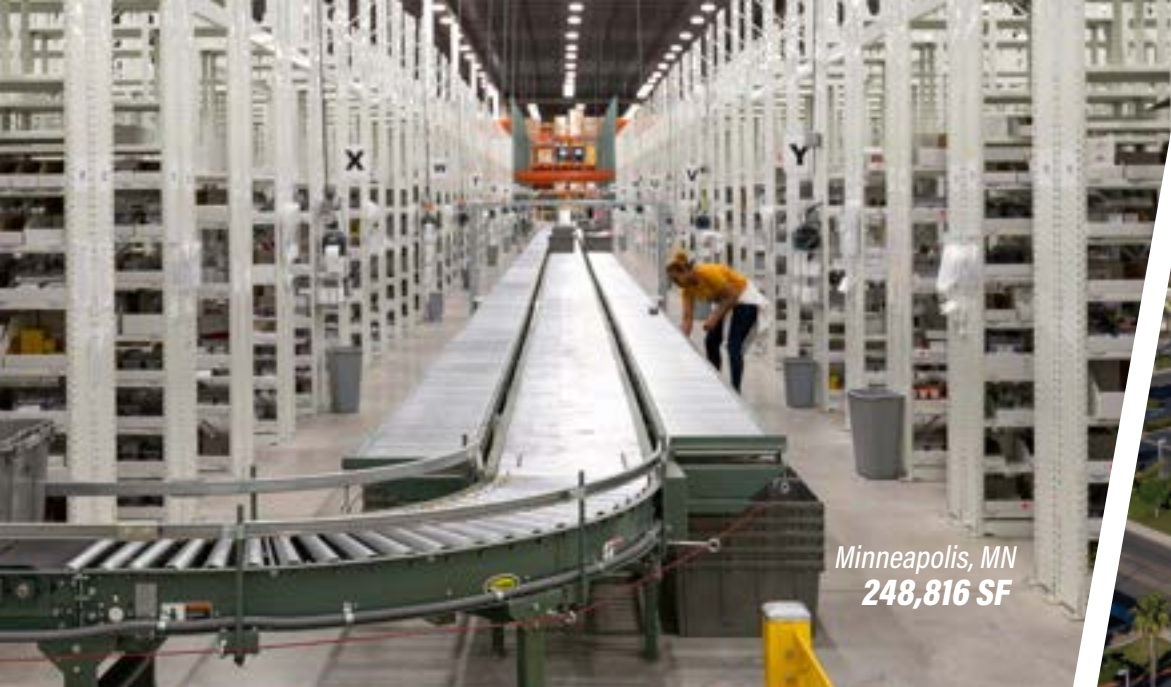
Minneapolis, MN 248,816 SF