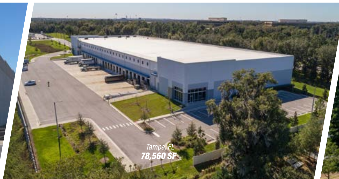
Tampa, FL 78,560 SF