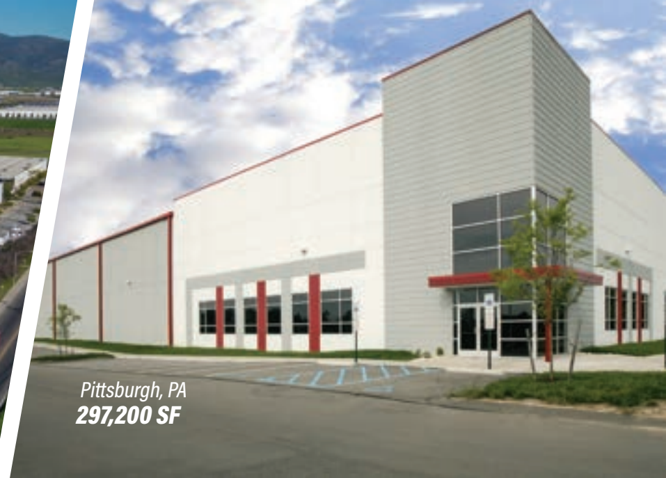
Pittsburgh, PA 297,200 SF