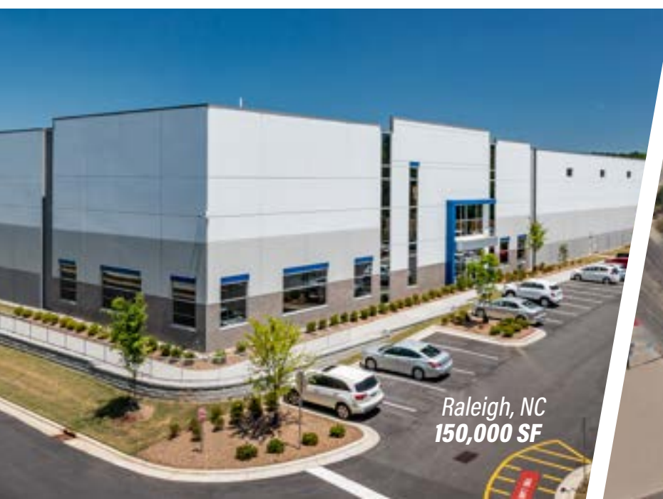
Raleigh, NC 150,000 SF