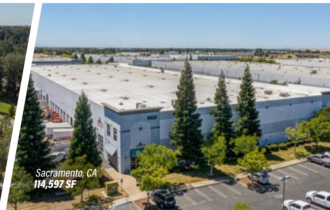
Sacramento, CA 114,597 SF