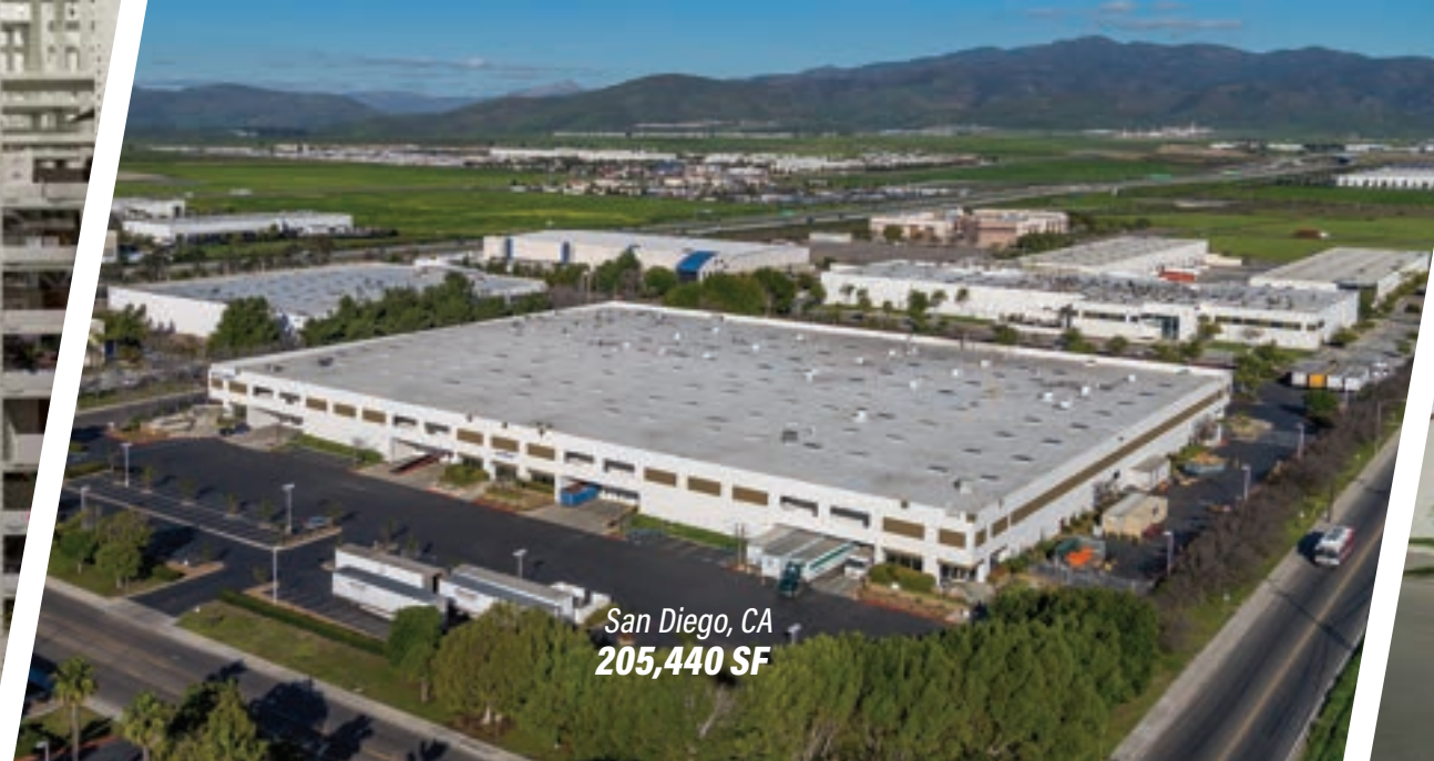
San Diego, CA 205,440 SF