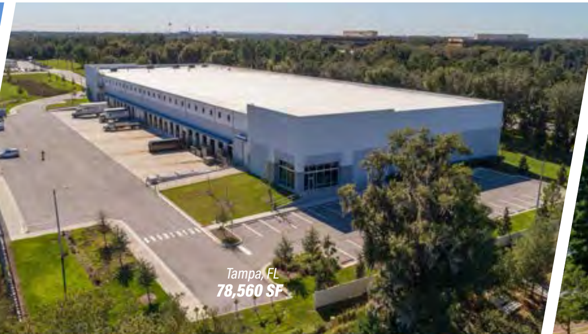
Tampa, FL 78,560 SF