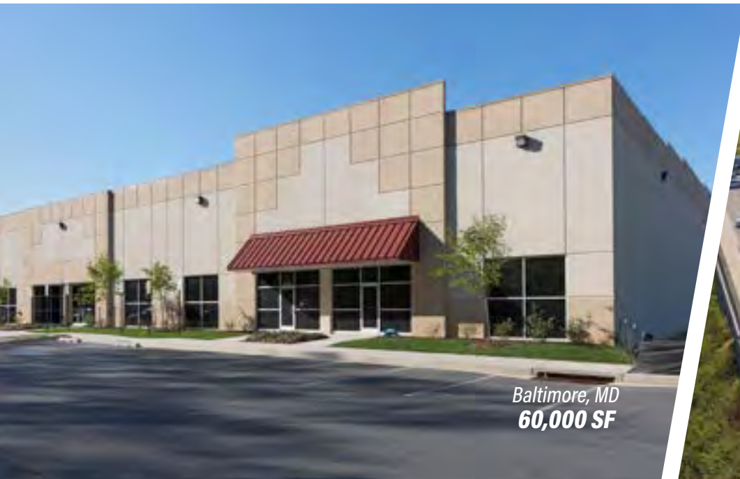
Baltimore, MD 60,000 SF