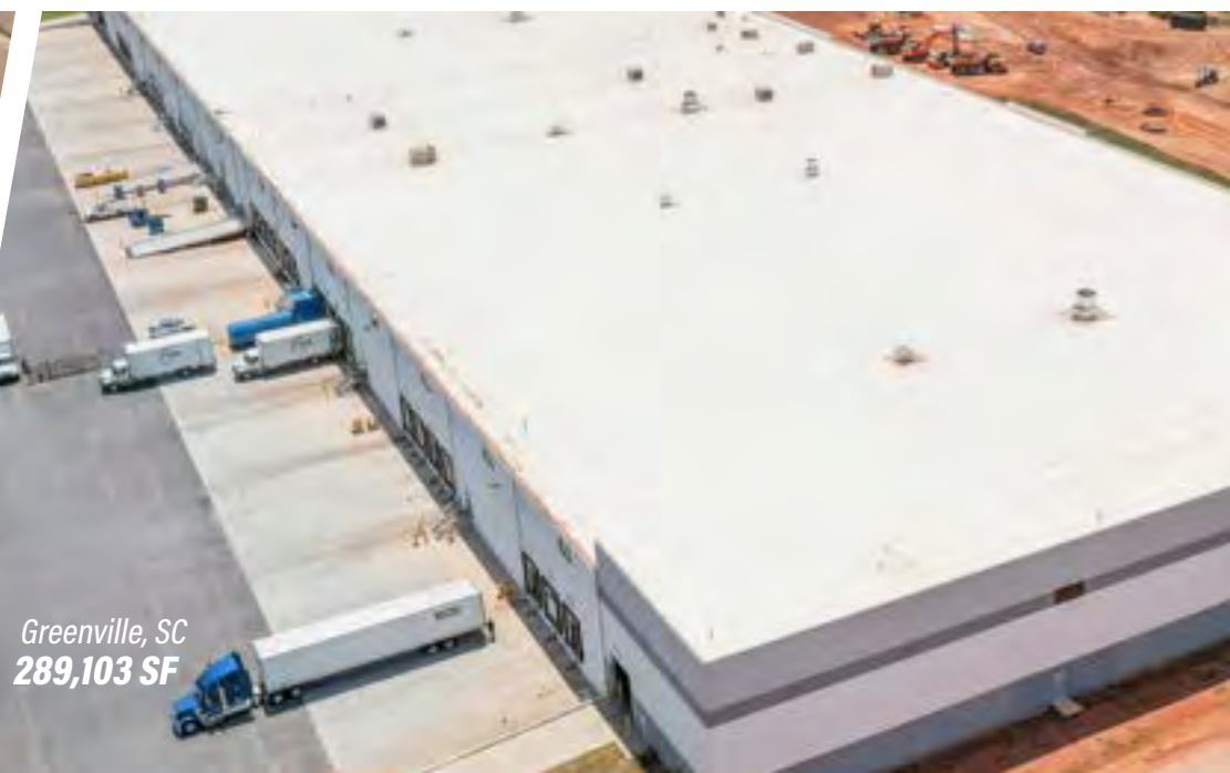
Greenville, SC 289,103 SF