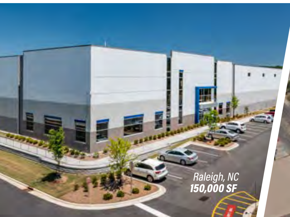
Raleigh, NC 150,000 SF