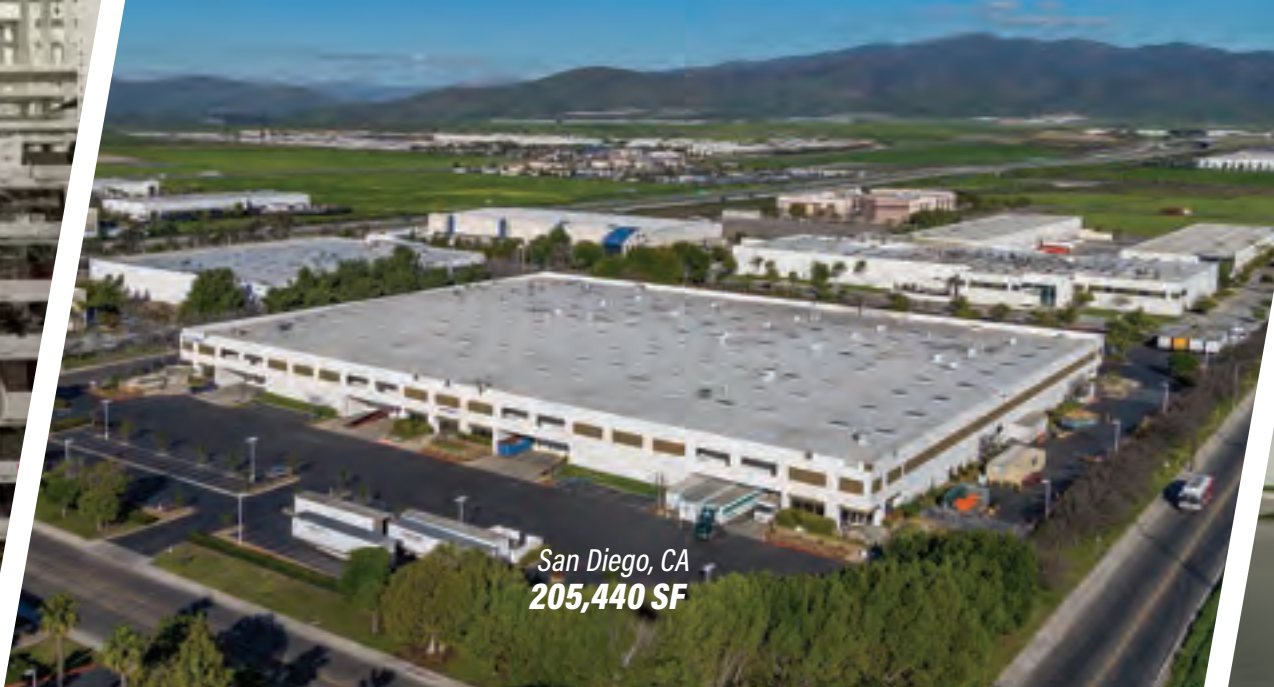
San Diego, CA 205,440 SF