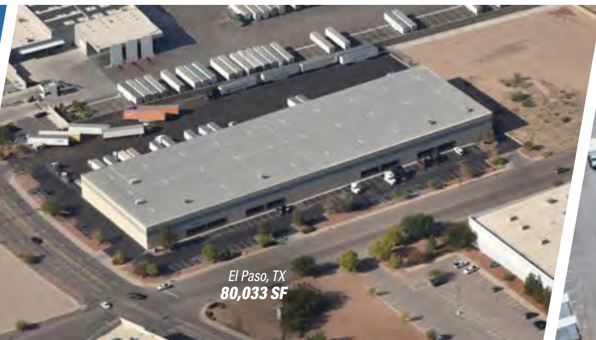
El Paso, TX 80,033 SF