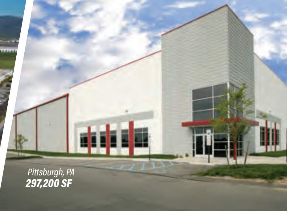
Pittsburgh, PA 297,200 SF