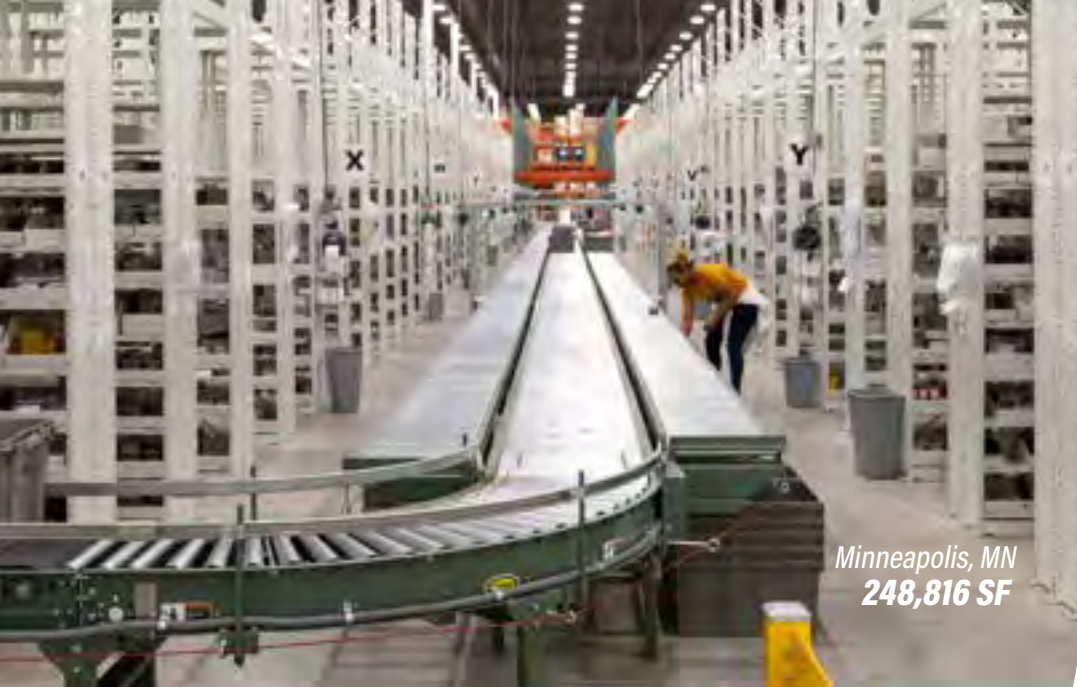
Minneapolis, MN 248,816 SF