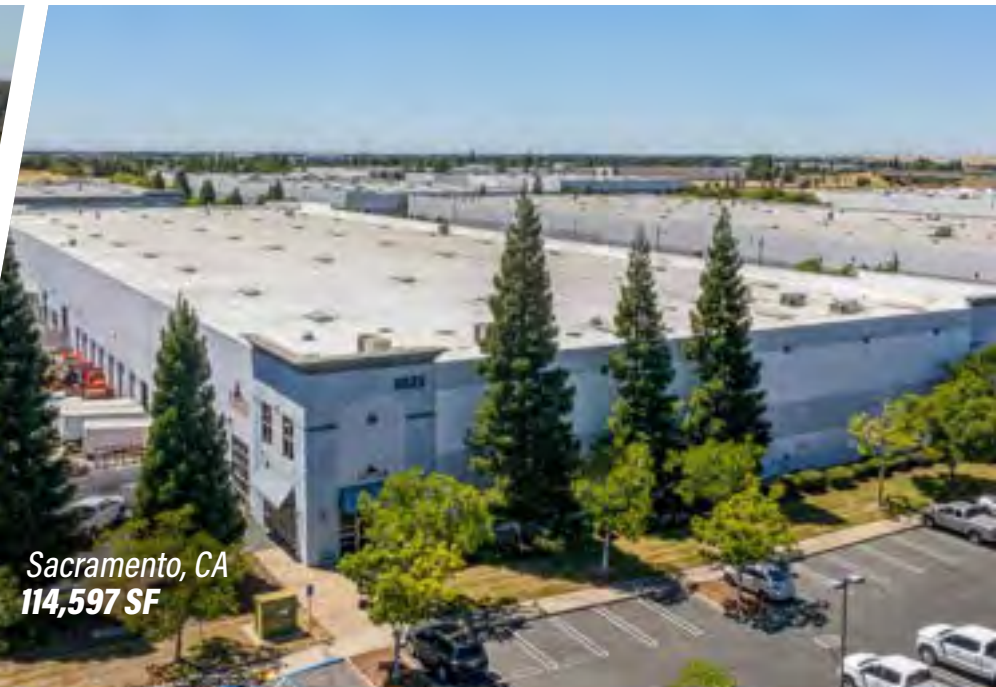
Sacramento, CA 114,597 SF